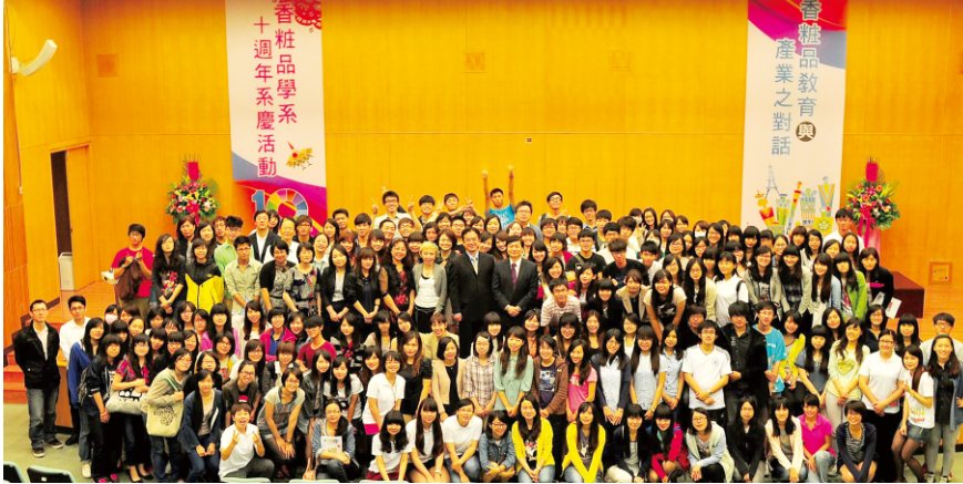
Cosmetic Education and Industry Conference