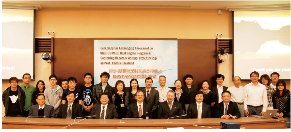
○ Signing Agreement on Double-degree with Uppsala University, Sweden