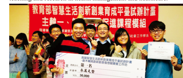
▶ A team from the Department of Occupational Therapy won first place in "Innovation and Creativity Contest" in the section of sprint/orthosis"

In future, with the learning atmosphere of internationalization, holistic education and evidence-based practice, the College of Health Sciences hope to offer a more completed selection of education opportunity by setting up programs such as doctoral program in healthcare management and medical information technology; core courses for master in smart healthcare management; master program in smart healthcare innovation and practical management; summative course module of public health, summative course module of practical healthcare and health promotion; course module of molecular diagnosis in preventive medicine; and course module of dental imaging technology, and investigating the possibility of establishing the DPT program, and to continue strengthening the collaboration with overseas sister schools, and establishing college level research centers, to further develop teaching and research in health management and healthcare.